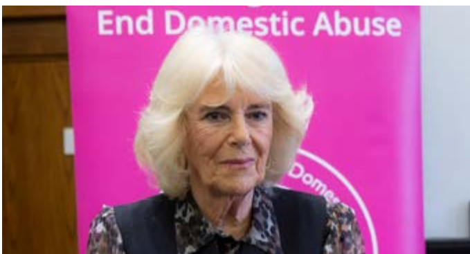
Her Majesty the Queen joining us for our 50th anniversary celebrations