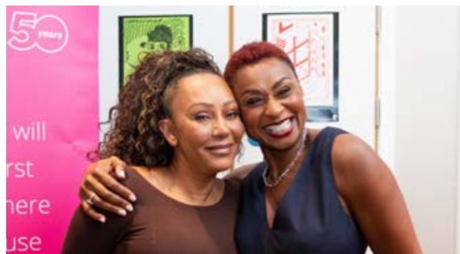
Our Patron Melanie Brown MBE (left) and Ambassador Michelle Griffith-Robinson OLY (right) at our national conference