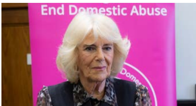
Her Majesty the Queen joining us for our 50th anniversary celebrations

We are proud of the impact we have had over the last 50 years. As we look forward to the next 50 years, we hope for a society where we are no longer needed and domestic abuse is not tolerated.